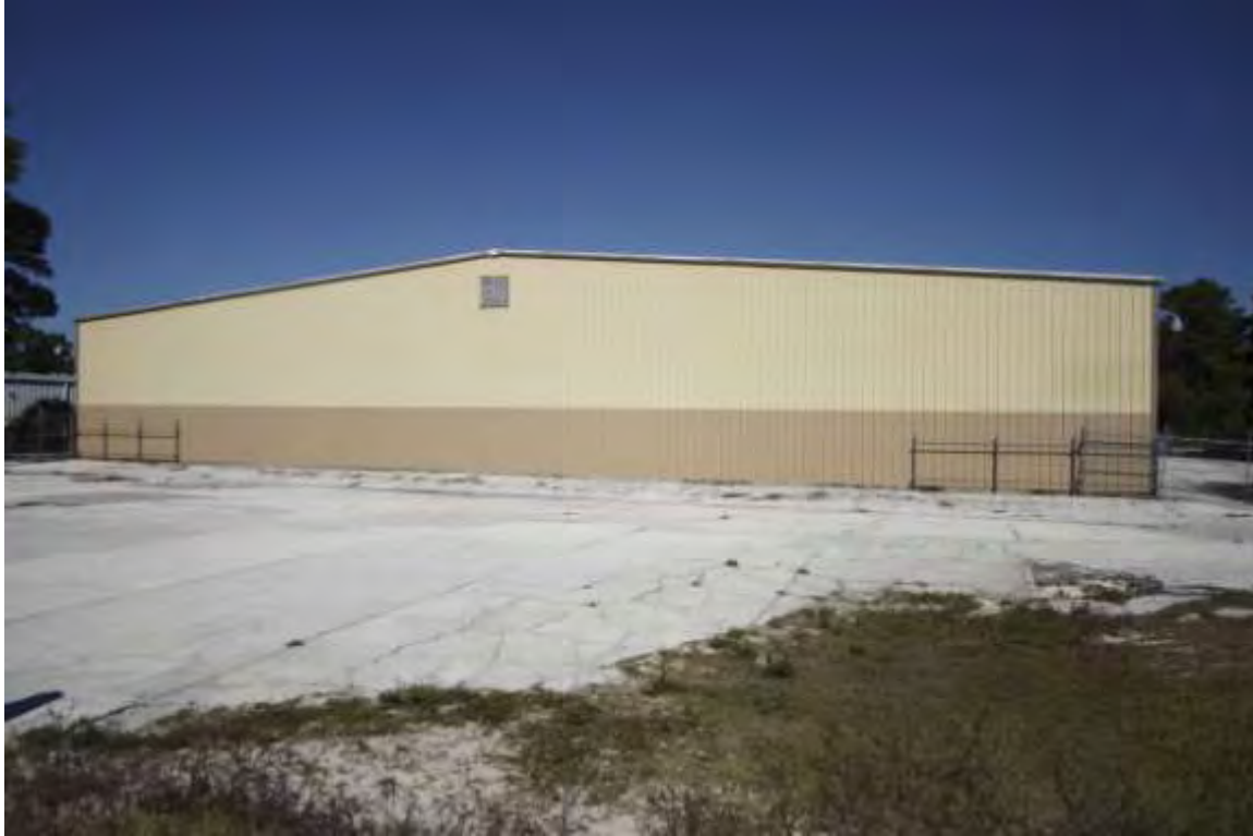
View from Little Road