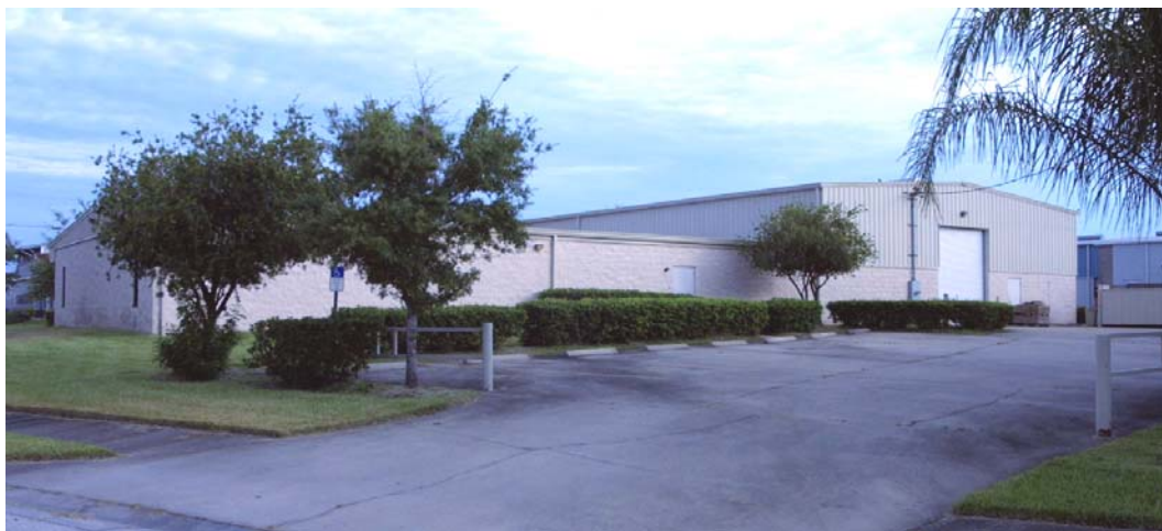
Ample Parking or Yard Space in Rear of Building